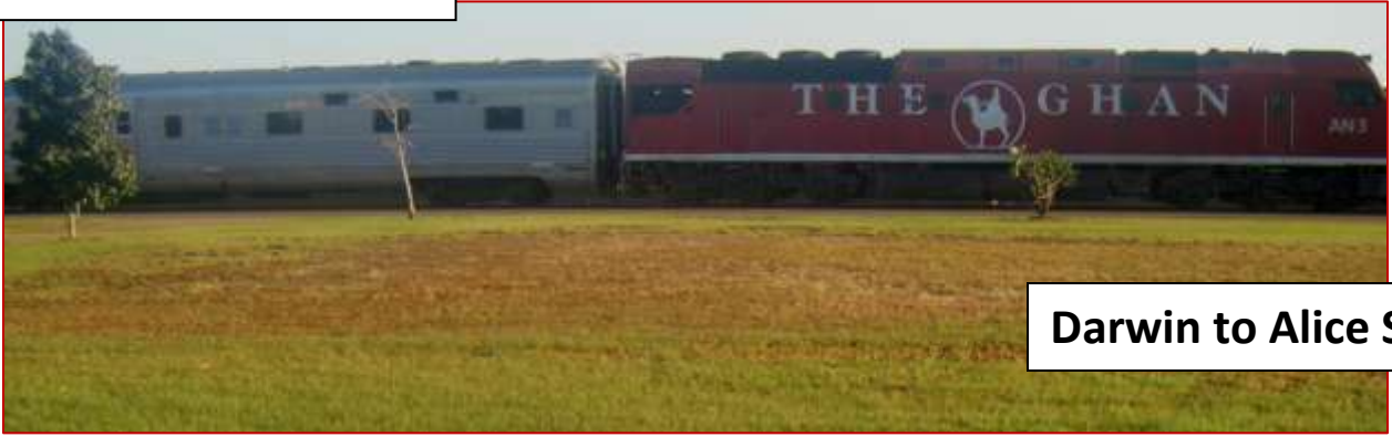
Darwin to Alice Springs