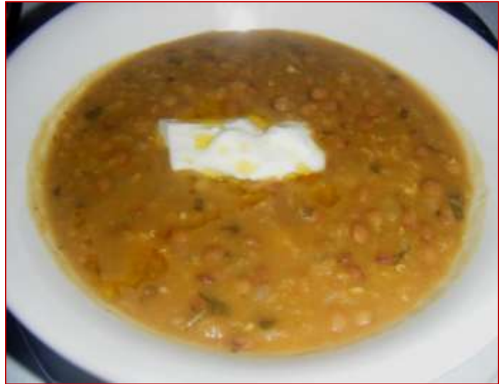
Sample Dinner of Soup appetizer, plus Salad and choice of entrée with wine followed by dessert