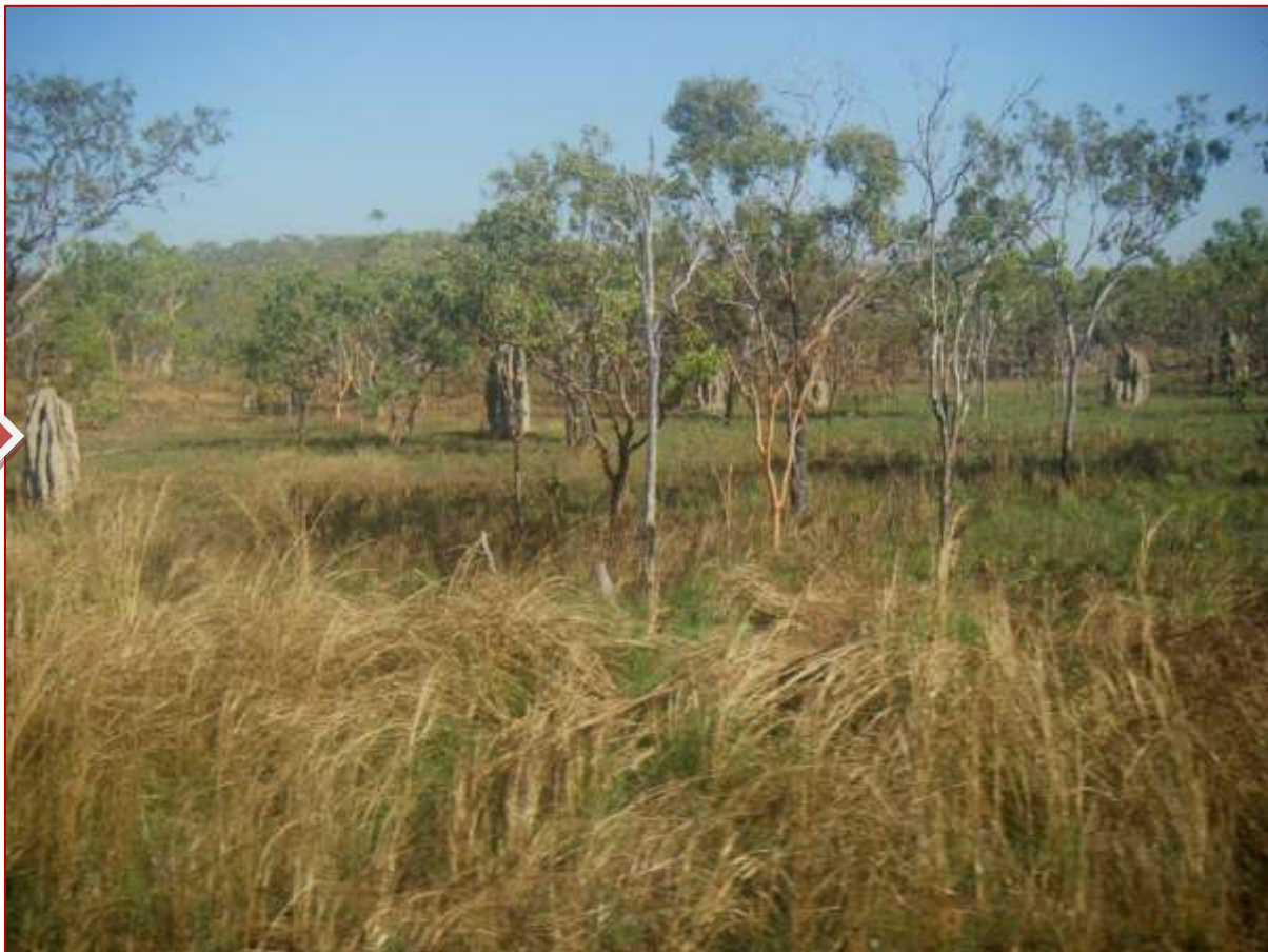
Note Termite Mounds