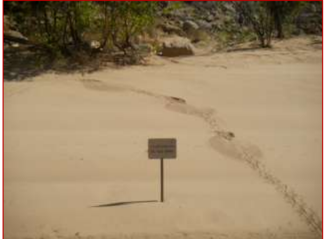
Katherine Gorge Boat Tour